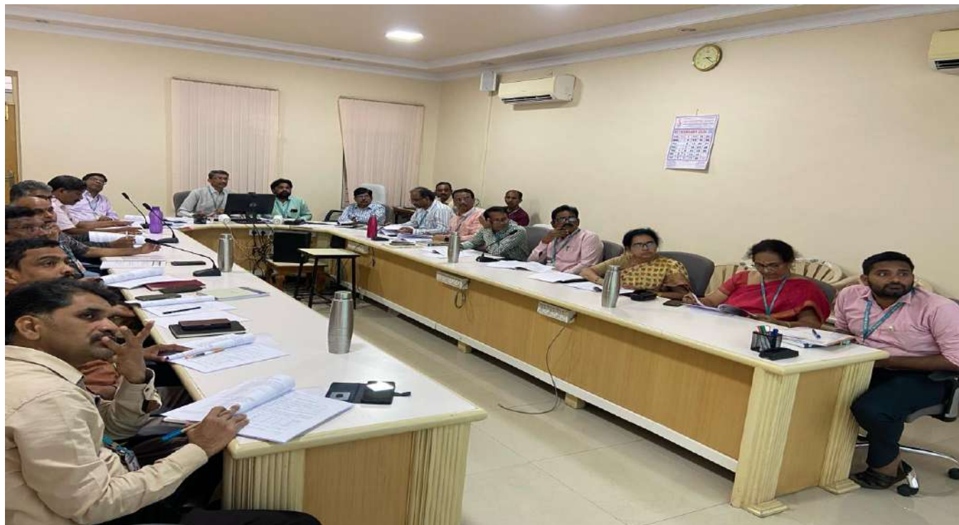
7 th IQAC Meeting held on 27.02.2024 - Venue: Committee Hall, Block-IV, KITSW