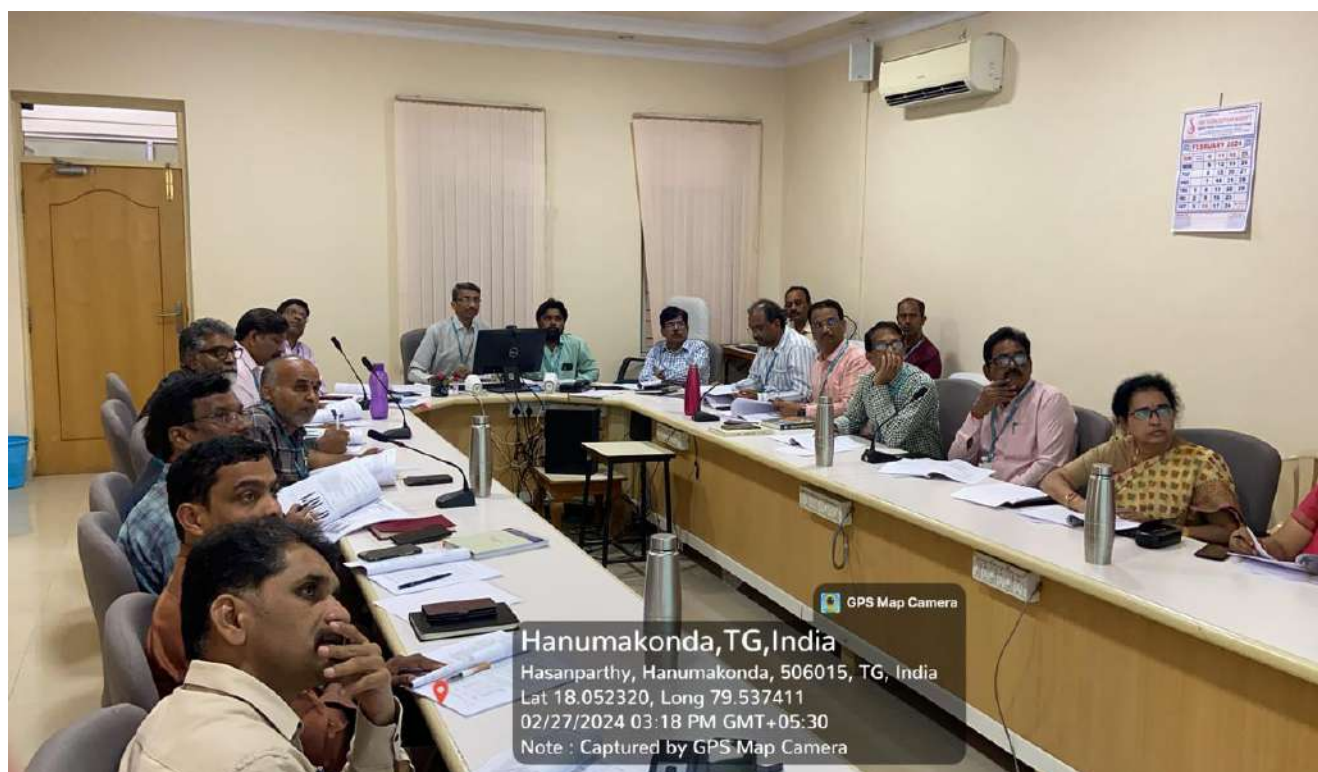
7 th IQAC Meeting held on 27.02.2024 - Venue: Committee Hall, Block-IV, KITSW

The following agenda points are unanimously resolved to approve and ratify the agenda points discussed in the 7 th IQAC meeting.