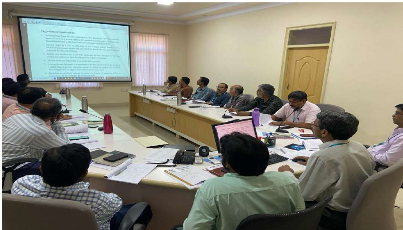
7 th IQAC Meeting held on 27.02.2024 - Venue: Committee Hall, Block-IV, KITSW